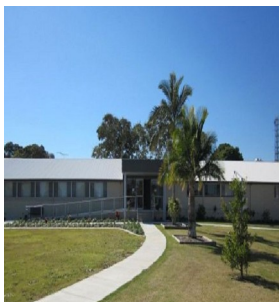
Redcliffe Bridge Club